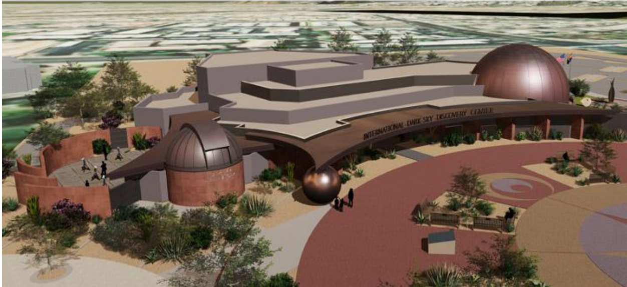
Caption: An architectural rendering of the International Dark Sky Discovery Center to be built in Fountain Hills, Arizona.

The planned Discovery Center has five major components supporting its educational mission. These include a Dark Sky Observatory with the largest telescope in the Greater Phoenix area, a state-of-the art Hyperspace Planetarium, a highly interactive Immersion Zone, a 150 tiered-seat theater with 8K technology, and a hands-on Einstein Exploration Station to teach the physics of light. A narrated 3D flyover of the Discovery Center, support statements from leaders throughout the state, and much more are here: darkskycenter.org